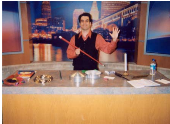
"The Great Brad"

We regret that at the present time we are unable to accept reservations or payment via the Internet.