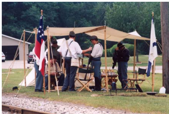
Encampment at Jefferson

Watch as the Union and Confederate soldiers battle for control of the railroad from the safety of your coach. Visit free our Civil War encampment with period merchants adjacent to the tracks at Jefferson.