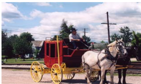
The Lonely Oak Stagecoach

The Lonely Oak Stagecoach will be providing round-the-block rides during this event. Lasting approximately 10 minutes, experience travel behind real 'horse-power' as our for-fathers did, a fun time for everyone.