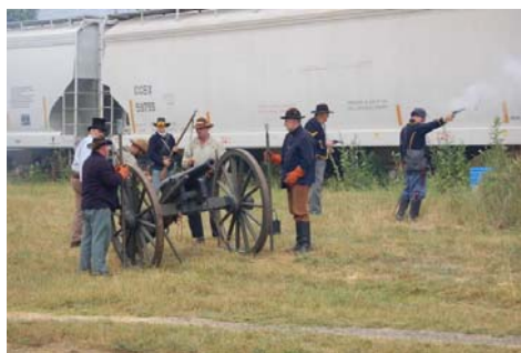
Field Cannon at the ready!